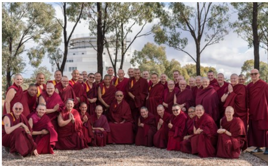
Heart of Wisdom Retreat

"I was very fortunate to receive financial assistance from IMI to be able to attend the retreat in Bendigo last May. I am very isolated from other Mahayana sangha living by myself, so to do retreat with Rinpoche and spend time with other sangha is essential for my inspiration and guidance."